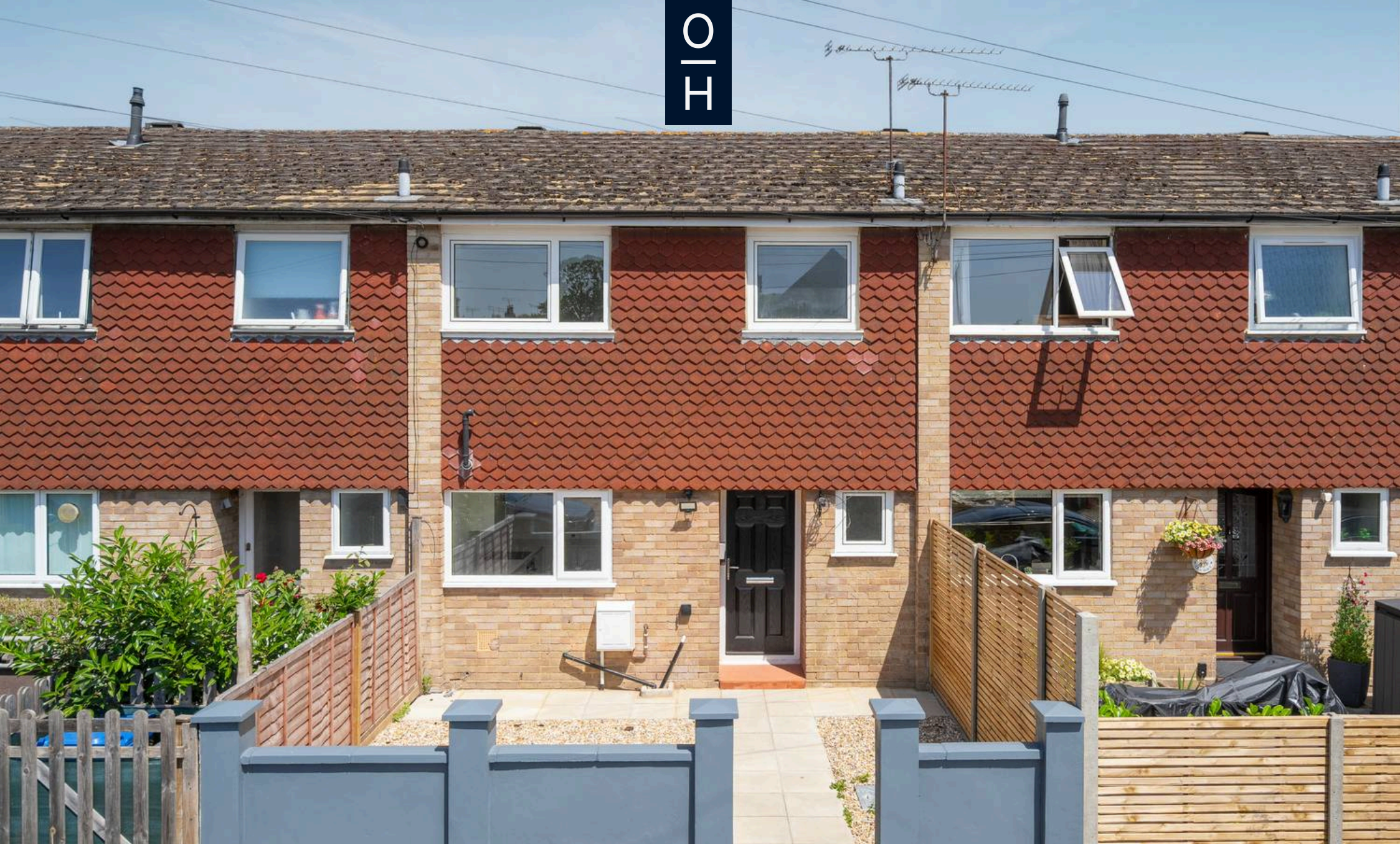
Leacroft, Sunningdale Guide Price £525,000