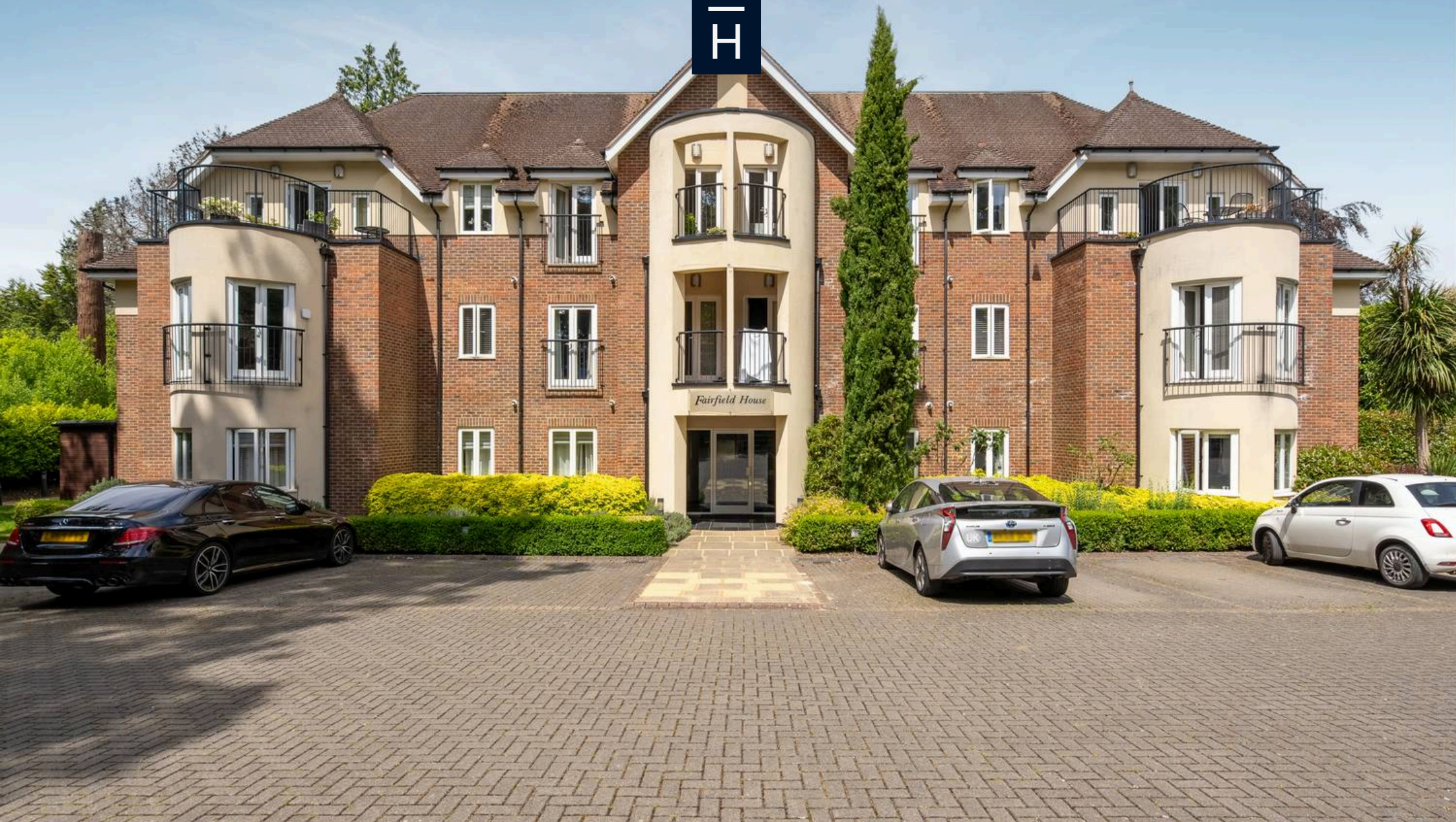
Fairfield House, Sunningdale Guide Price £530,000