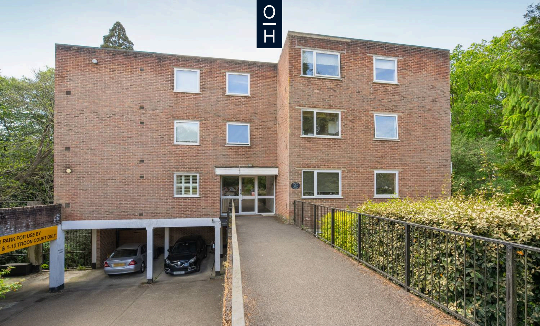
Troon Court, Sunninghill Guide Price £300,000