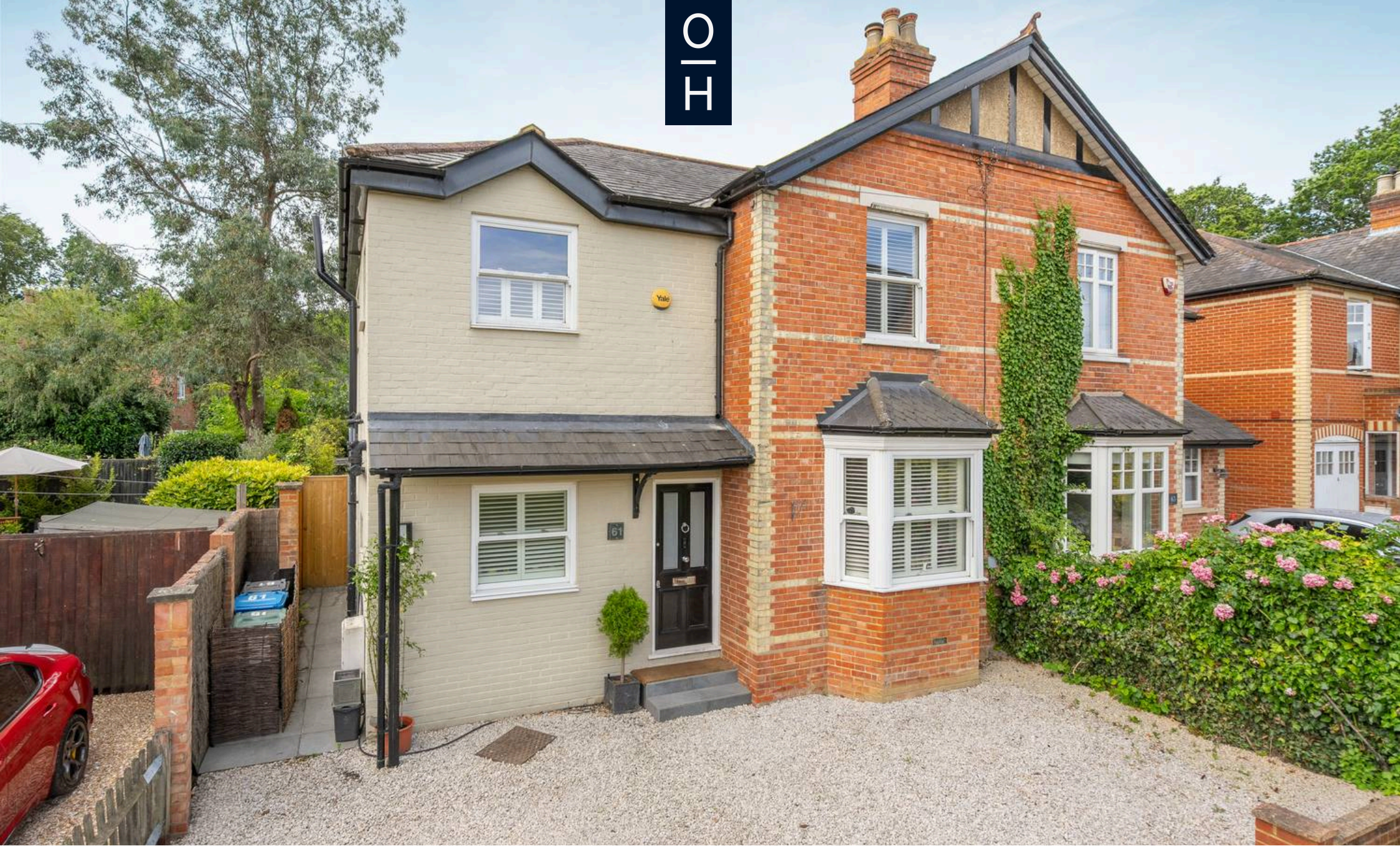
Halfpenny Lane, Sunninghill Guide Price £900,000