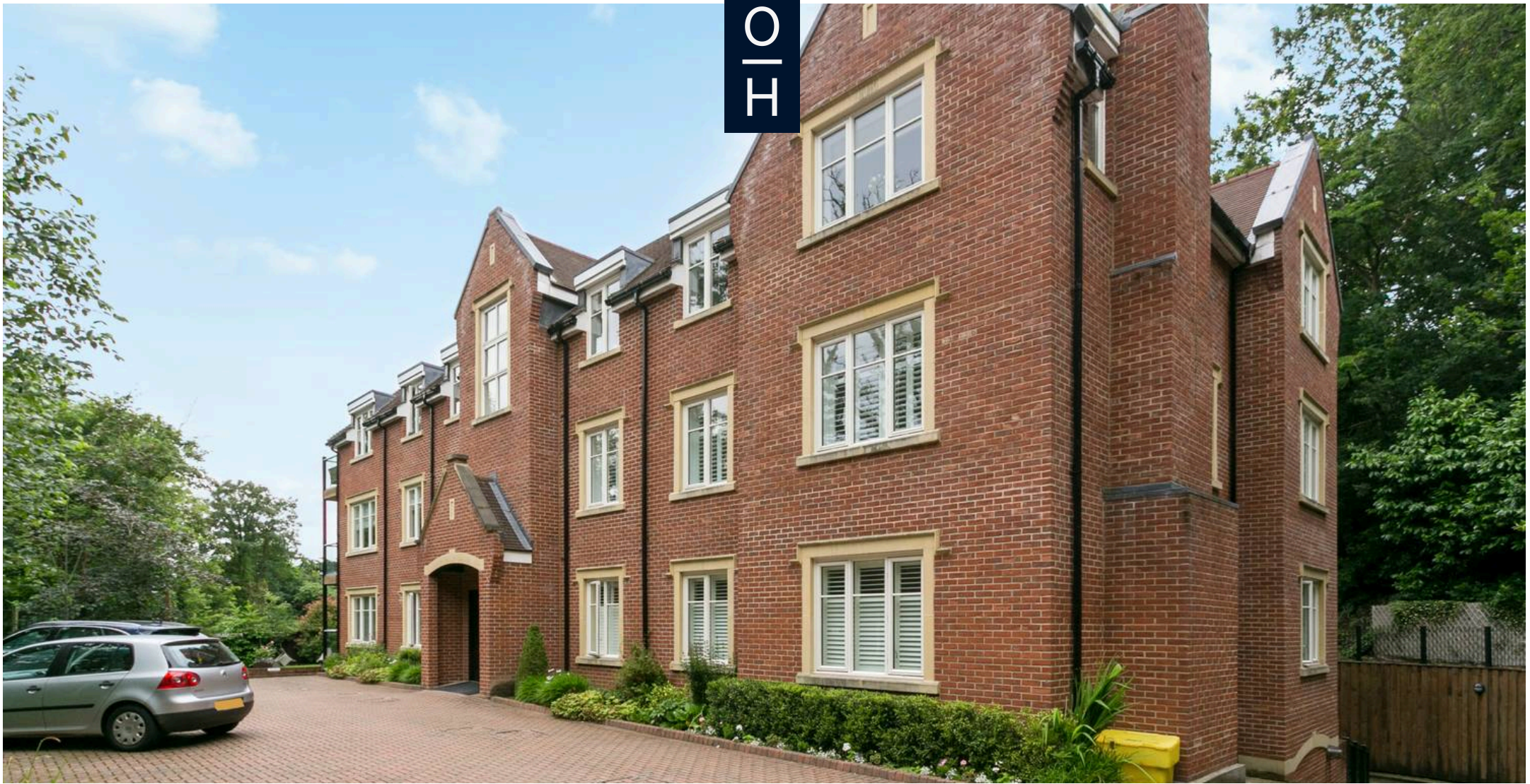
Ascot Corner Ascot