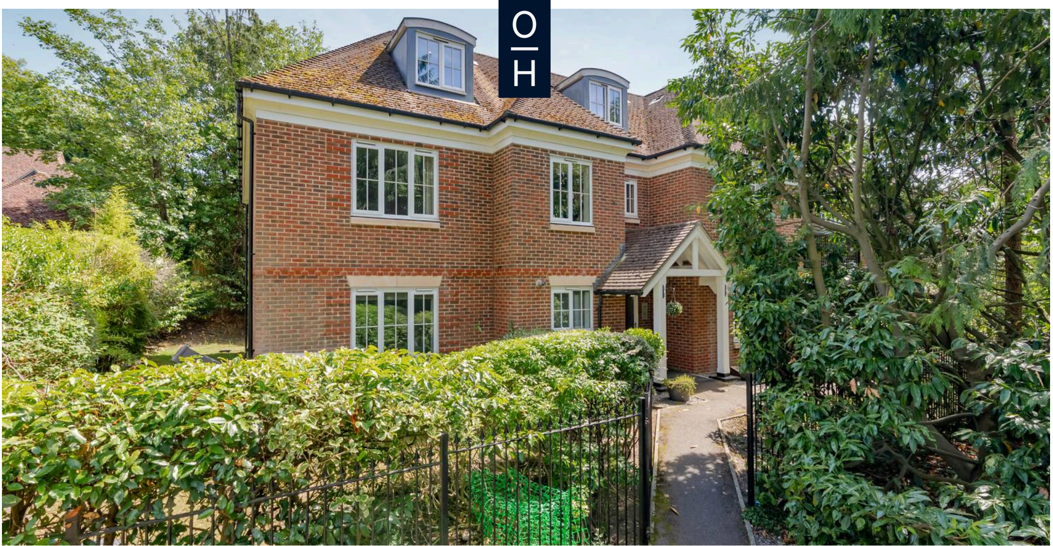
Fairways House ,London Road Sunningdale