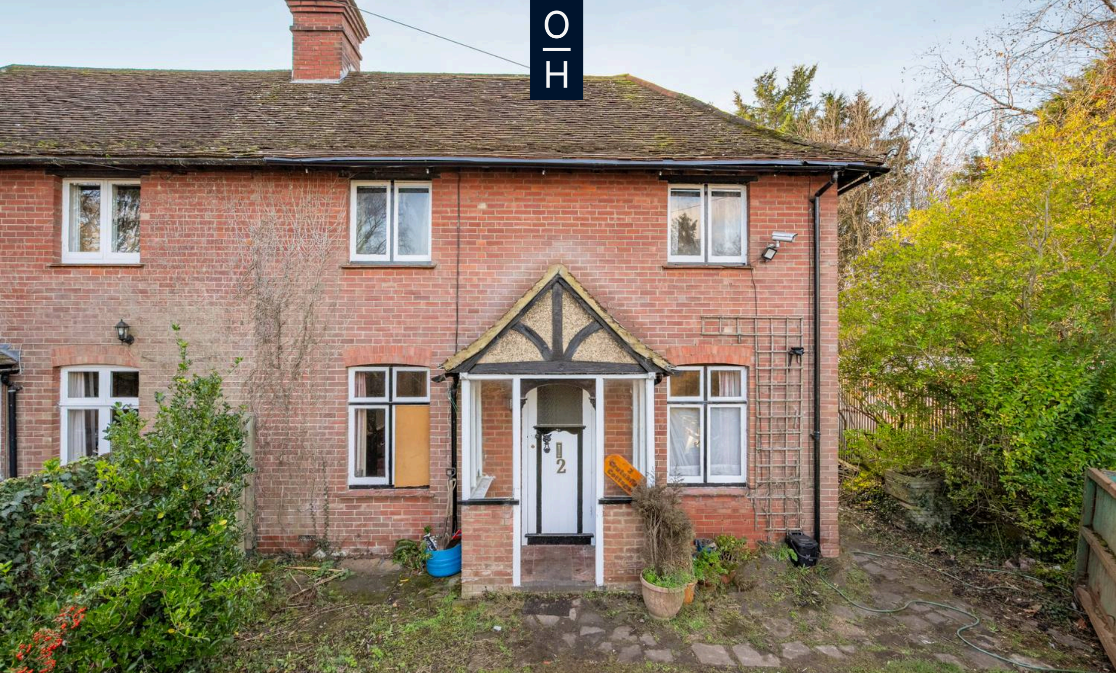
Cruchfield Cottages Hawthorn Hill, Warfield In Excess of £595,000