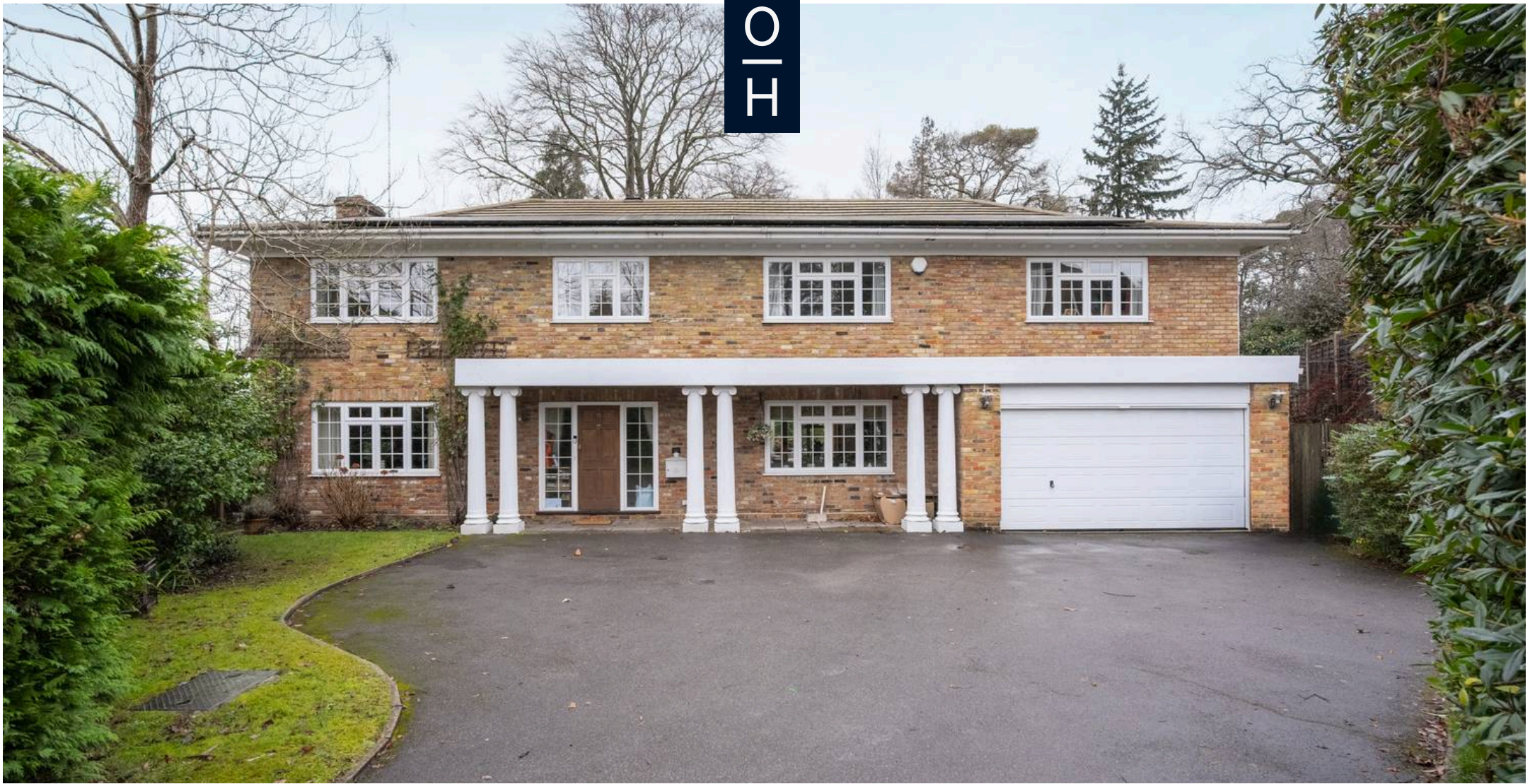
Armitage Court Sunninghill