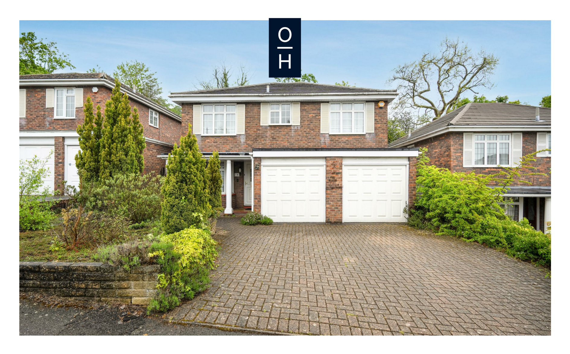
Lodge Close, Englefield Green