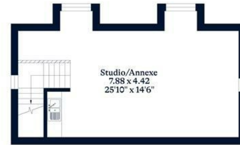
Garage Annexe First Floor