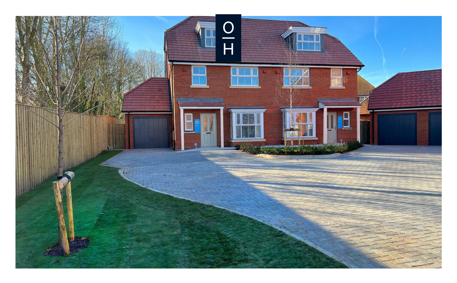
Honeysuckle Close, Windsor