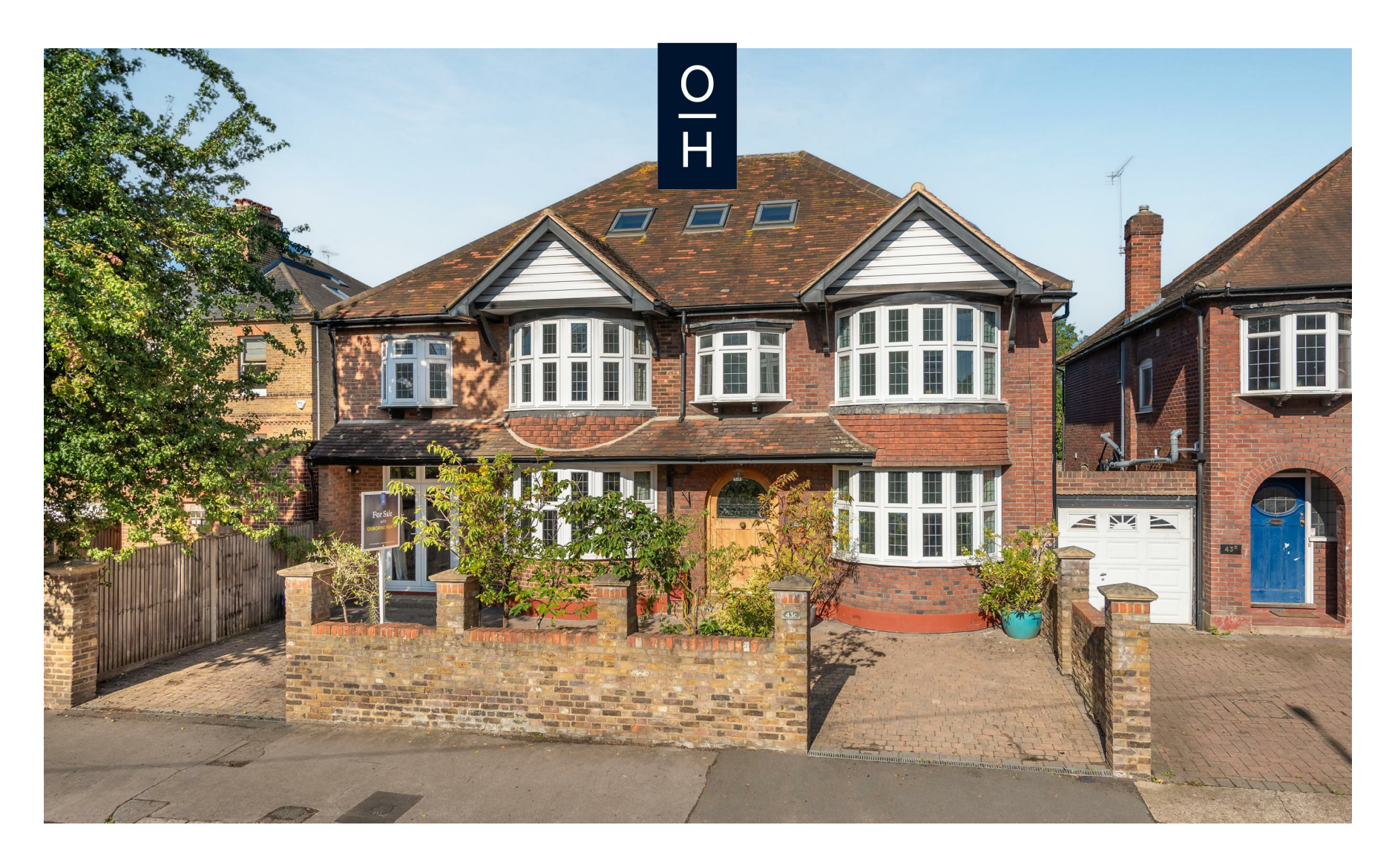
Alma Road, Windsor